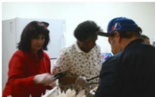
Serving-up Some Turkey for the Client Party!