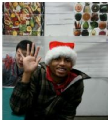
Hello and Happy Holiday's from San Leandro