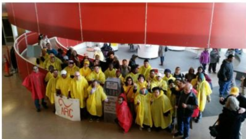
Arc presses for a 10% Increase in rates locally

The day also called for local demonstrations. One was at the Ed Roberts Campus in Berkeley where Arc clients and staff gathered to "Speak Out for Justice" much like the demonstrators in Sacramento.