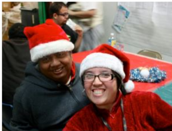
Now, This is the Holiday Spirit!